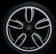
» 18" John Cooper Works Cup Spoke, 2-tone