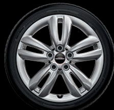
» 17" John Cooper Works Track Spoke, Silver

The wheels are the finishing touch to the head-turning looks and distinctive go-kart feel you'd expect from a John Cooper Works.