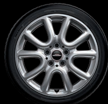
» 17" John Cooper Works Race Spoke, Silver