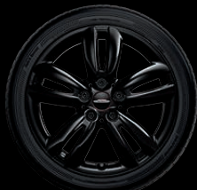
» 17" John Cooper Works Track Spoke, Black